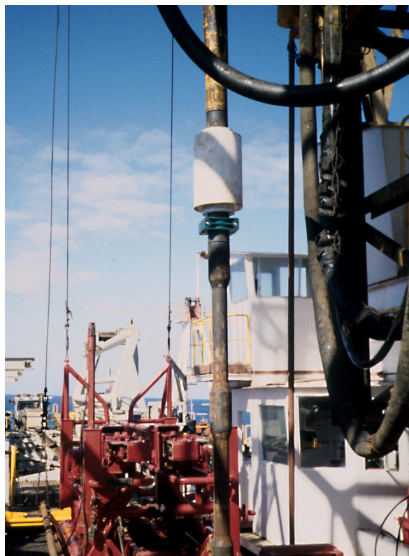
The pilot sensor deployed on the JOIDES Resolution during Leg 179. The sensor is rigidly clamped in place using wedge style clamps.