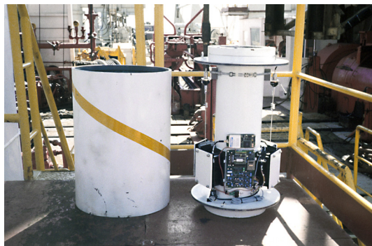
The pilot sensor electronic package contains a 3-axis accelerometer, wireless modem, PC board and batteries.